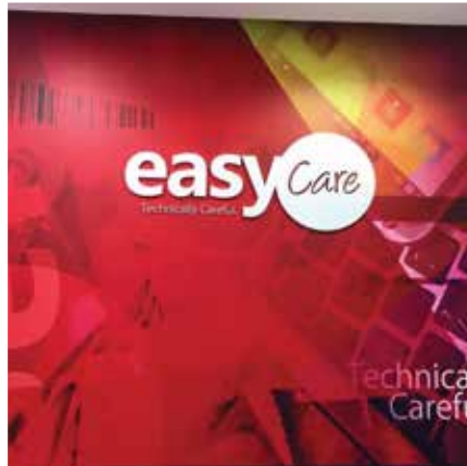
Easy Care Model Collection Centres.